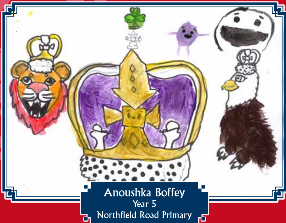
Anoushka Boffey Year 5 Northfield Road Primary