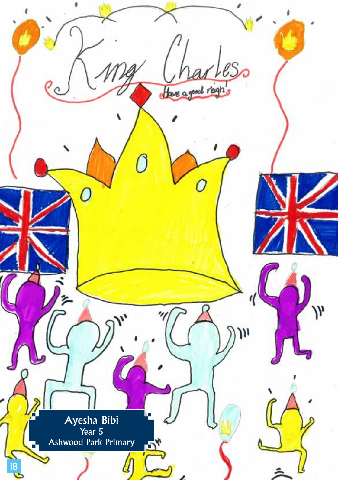
Ayesha Bibi Year 5 Ashwood Park Primary